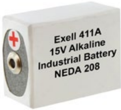
Industry Standard Dimensions mm (inches)