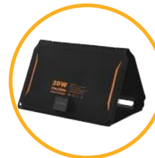
3D Actual Model