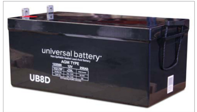
Due to continuous improvements to our products, product may vary slightly from depiction.